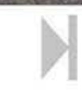
◀◀ Angle of View 39° Horizontal ( 50 mm Lens )