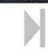
◀◀ Angle of View 39° Horizontal ( 50 mm Lens )